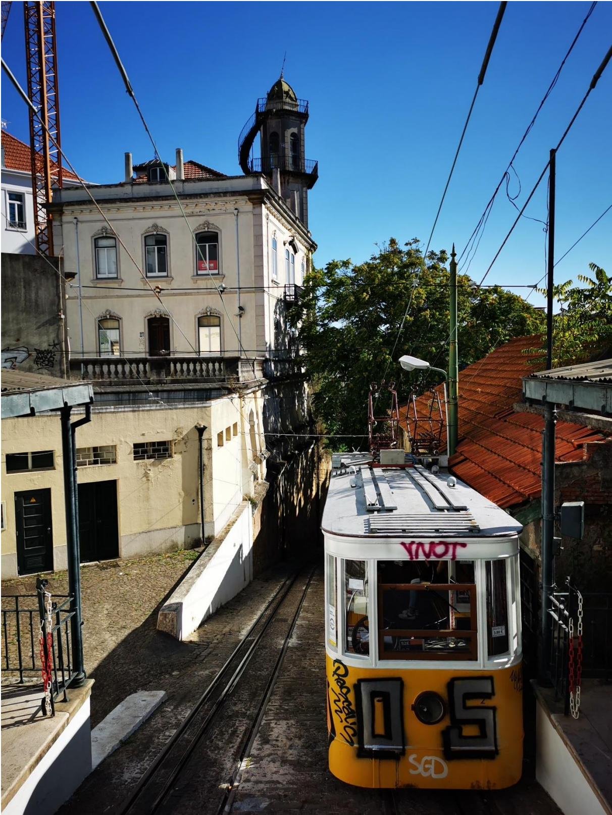
Abbildung 2: typische Lissaboner Straßenbahn