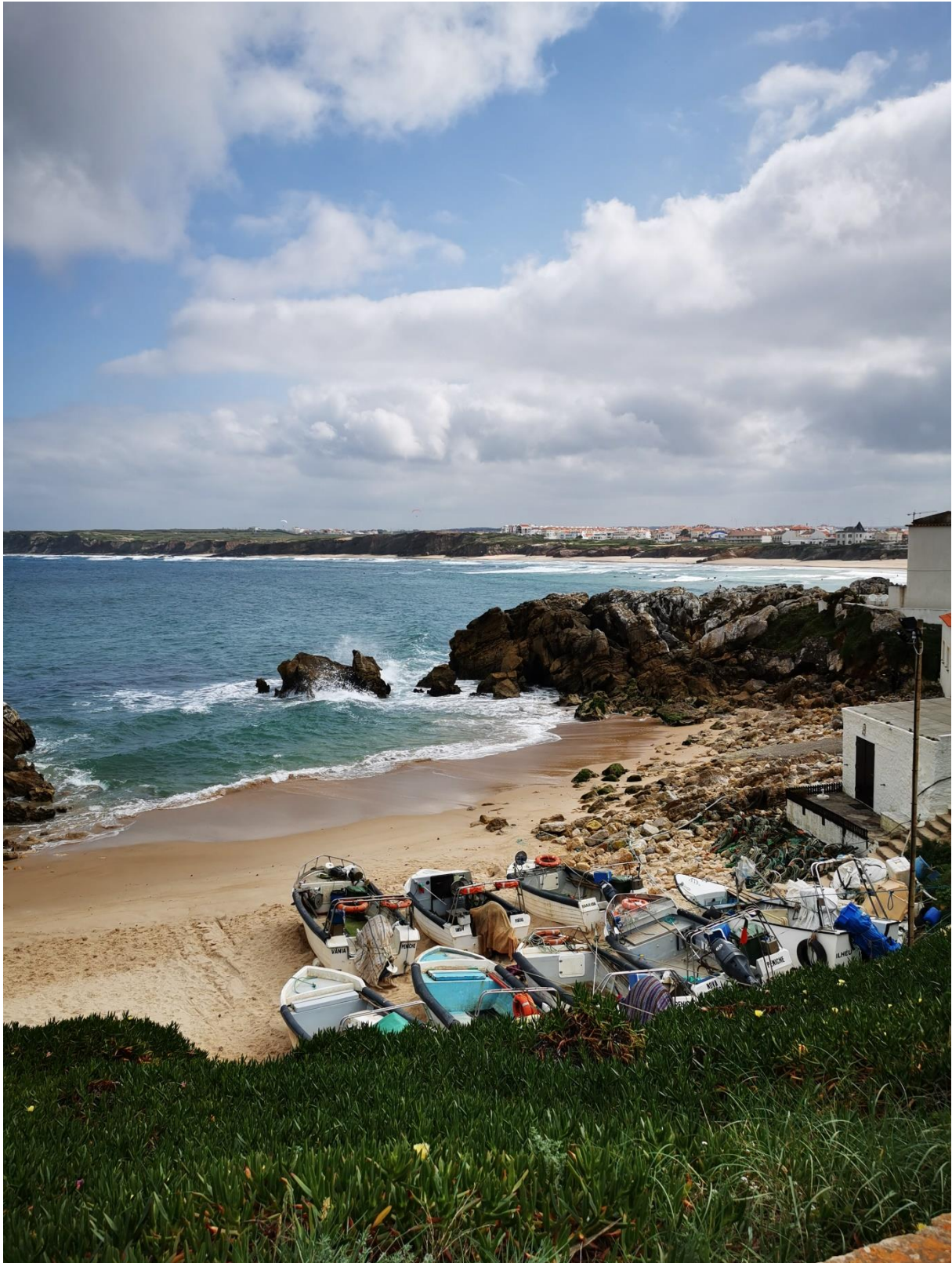
Abbildung 1: Hafen von Baleal bei Peniche